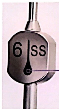
Teardrop thumb control